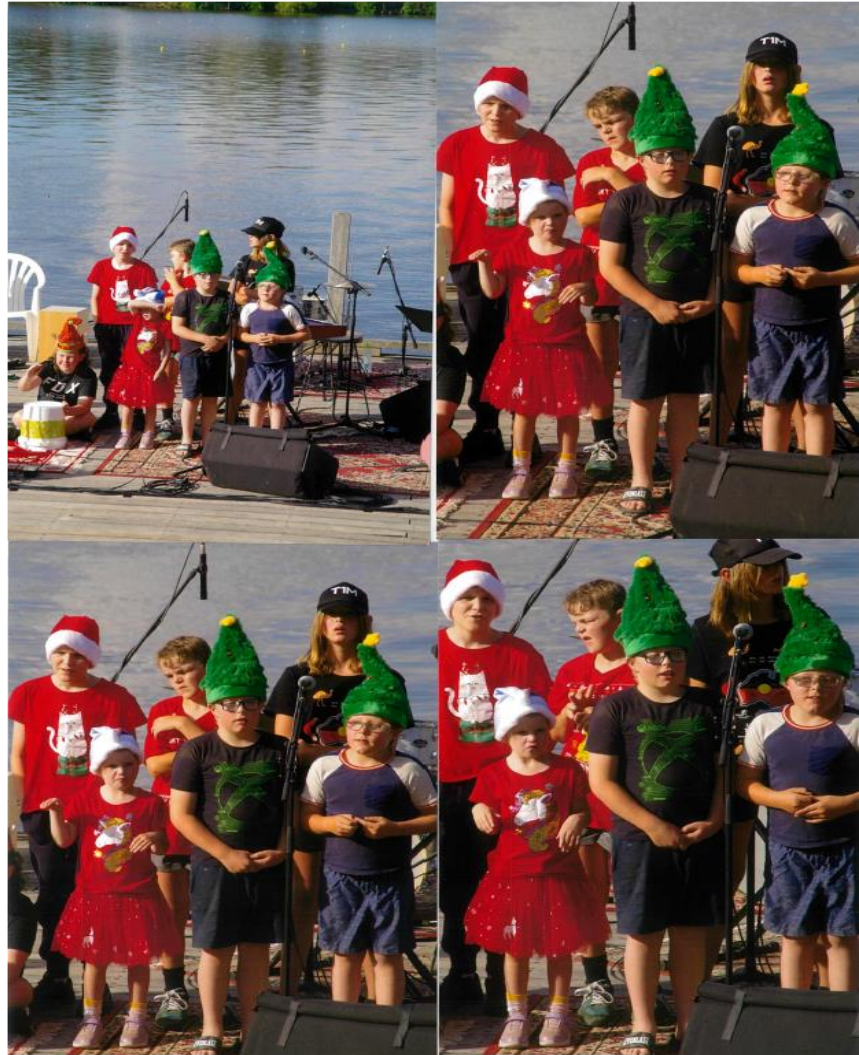
St Joseph's school perform the Little Drummer boy.