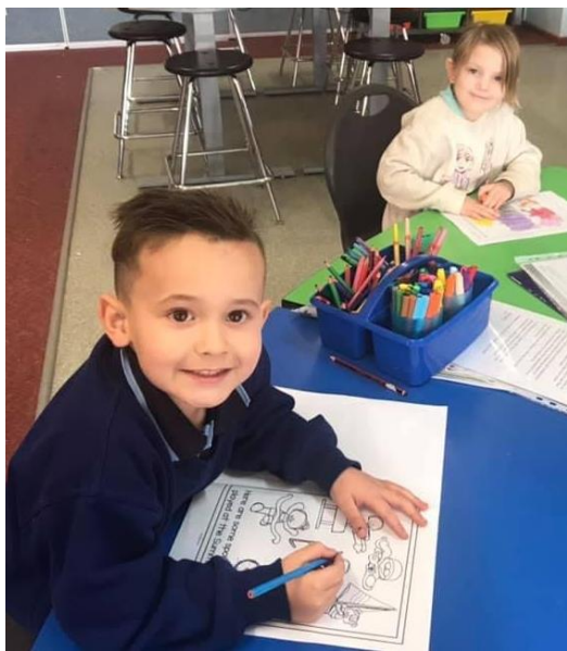
Schooling over lock down