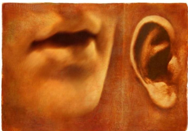
Ephatha – be opened!

At one stage, one of the supervisors sent me to talk to an old man in a corner, warning me that he was totally blind and totally deaf. Here was a challenge. How could I talk to a blind and deaf man? The supervisor said simply, "Take his hand and write on the palm." So, patiently, I would sit with him for an hour or so writing with my finger on the palm of his hand. It was amazing. Eventually I started telling him jokes. He'd concentrate on what I was writing on his hand, then pause, and suddenly start laughing.